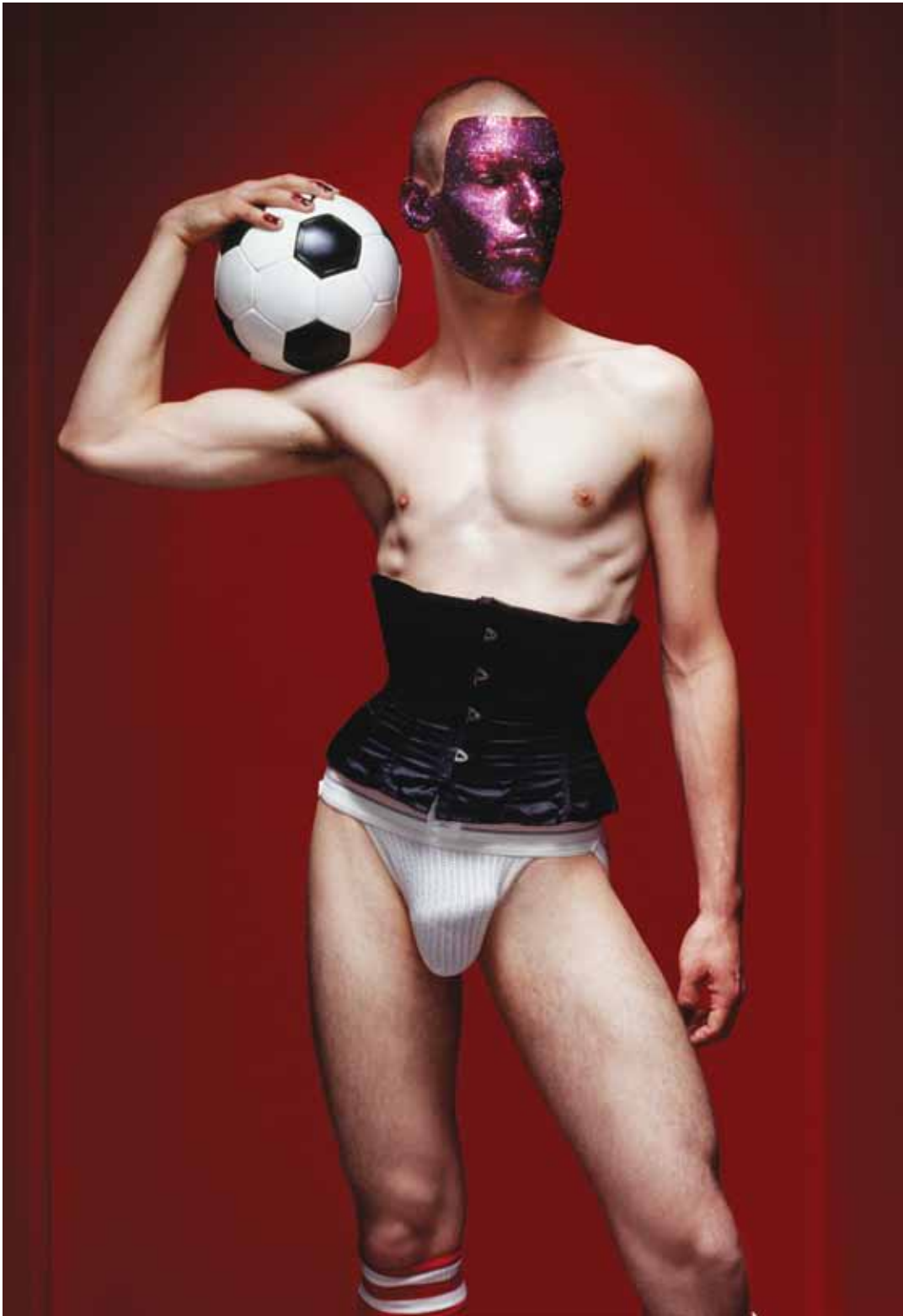
Erwin Olaf, Rouge, Player 1 , 2005. Courtesy of Erwin Olaf Studio.

“Kitsch is anti-essentialist and deeply democratic. It is not a stored-up cultural capital that feeds off its ancestry or intellectual depth, but rather a free radical that ignites both what is valued and what is discarded. It is precisely this equalizing talent that makes kitsch so hard to accept.” Jennifer Gilmore (USA, based in New York), novelist and author of Something Red and The Mothers , reminds us that “Greenberg himself came to reject his own notion of kitsch,” and while “looking at kitsch in the literary world, one of the primary concerns of Greenberg’s piece, it makes itself known in a variety of ways. We see it through irony, for example. It signals the reader with a wink, always aware of itself as in some of the novels by Philip Roth, Umberto Eco and Salman Rushdie.” We can come