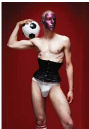
Front Cover: Erwin Olaf, Rouge, Player 1 , 2005.