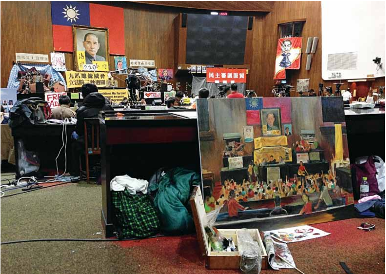
Students protesting inside Taiwanese Parliament; on the right side painting by Chen Ching-Yuan. March 2014.