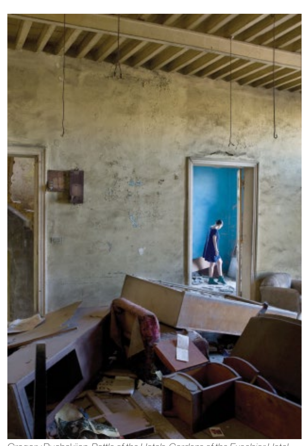
Gregory Buchakijan, Battle of the Hotels, Gardens of the Excelsior Hotel, from the Abandoned Dwellings in Beirut Series, 2012.