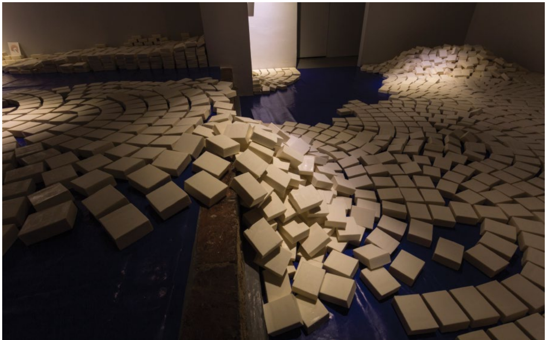
Hera Büyüktaşçıyan, In Situ , 2013, PiST/// Interdisciplinary Project Space, Istanb