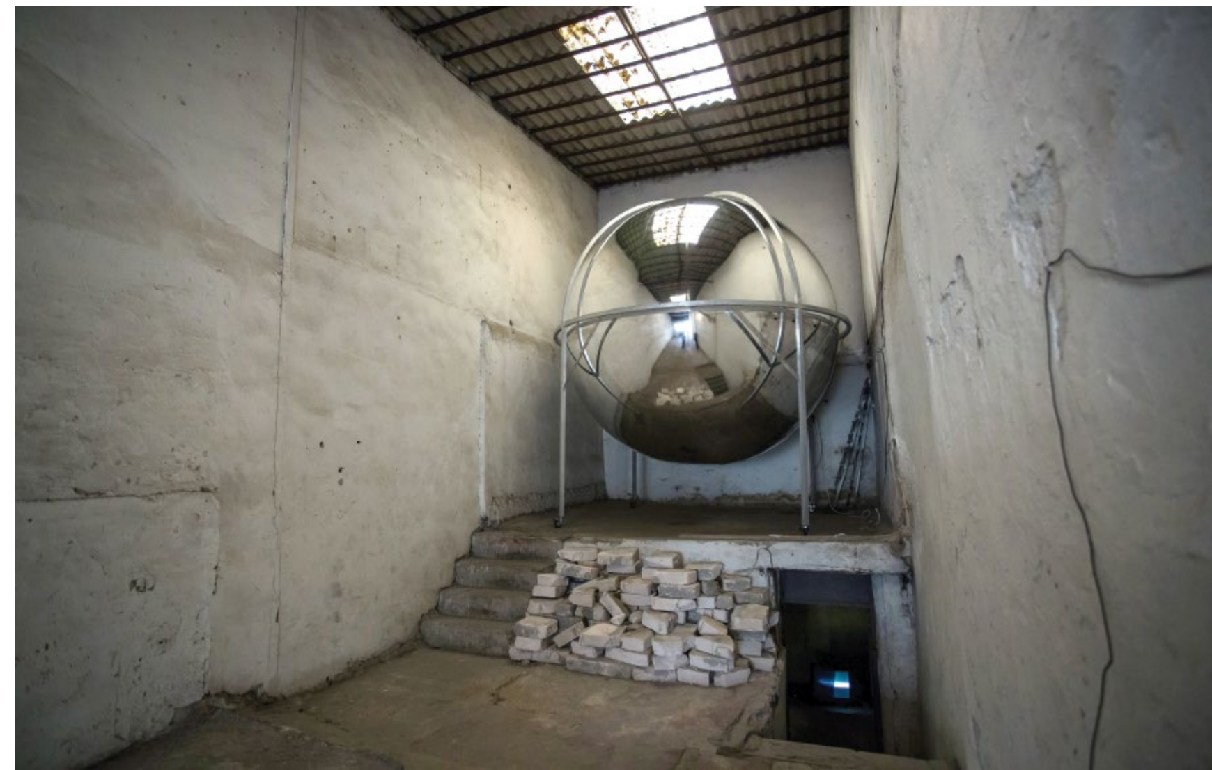
Trevor Paglen, Prototype for a Nonfunctional Satellite (Design 4; Build 3), 2013. Mylar, steel.